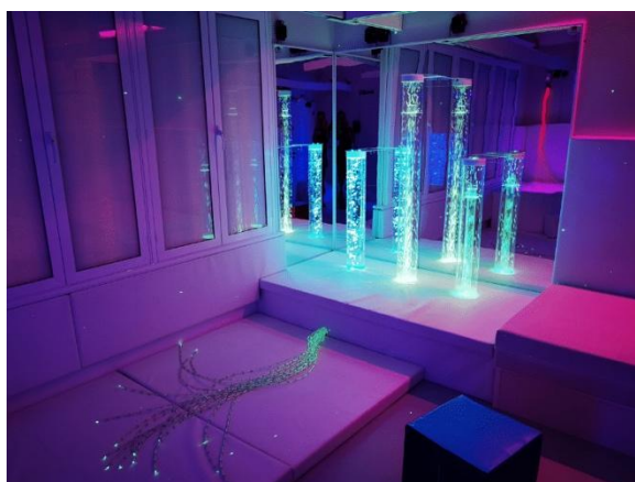
(Examples not actual room)